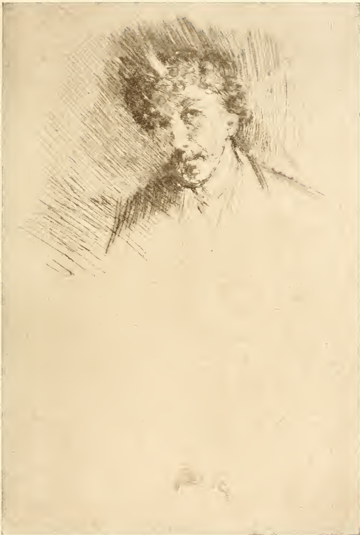
WHISTLER WITH THE WHITE LOCK.

(From the etching in the Avery Collection: Reproduced by courtesy of the Print Department of the New York Public Library.)